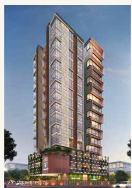
BLUE LOTUS - Khar W MahaRera No. P51800033826