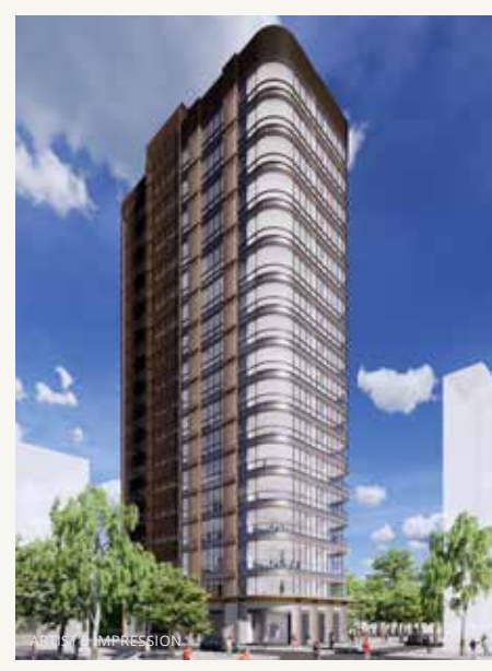
RISHABRAJ CHAMBERS - Borivali E MahaRera No. P51800045471