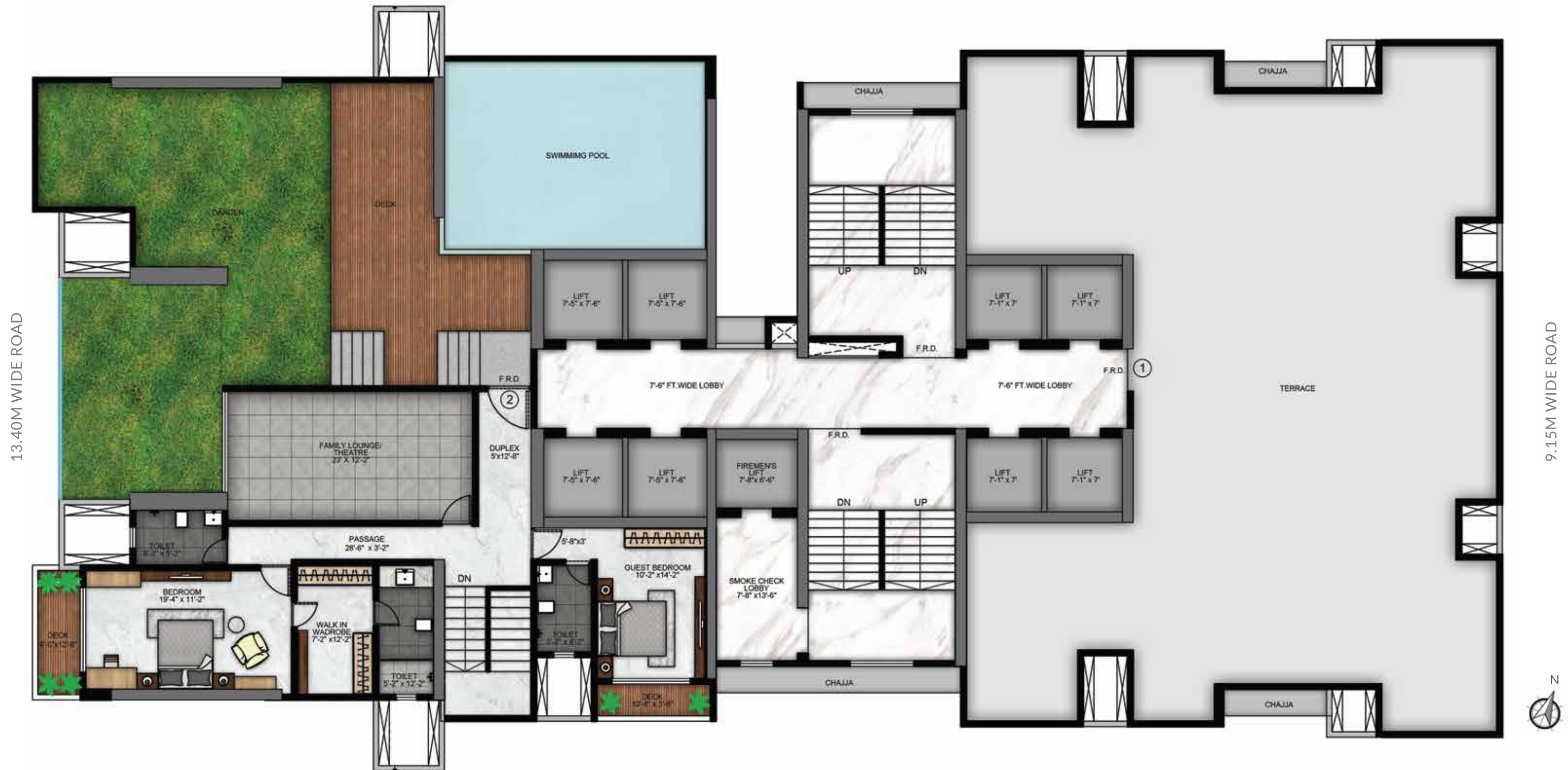
34TH FLOOR PLAN DUPLEX FLAT NO. 2 (UPPER LEVEL)