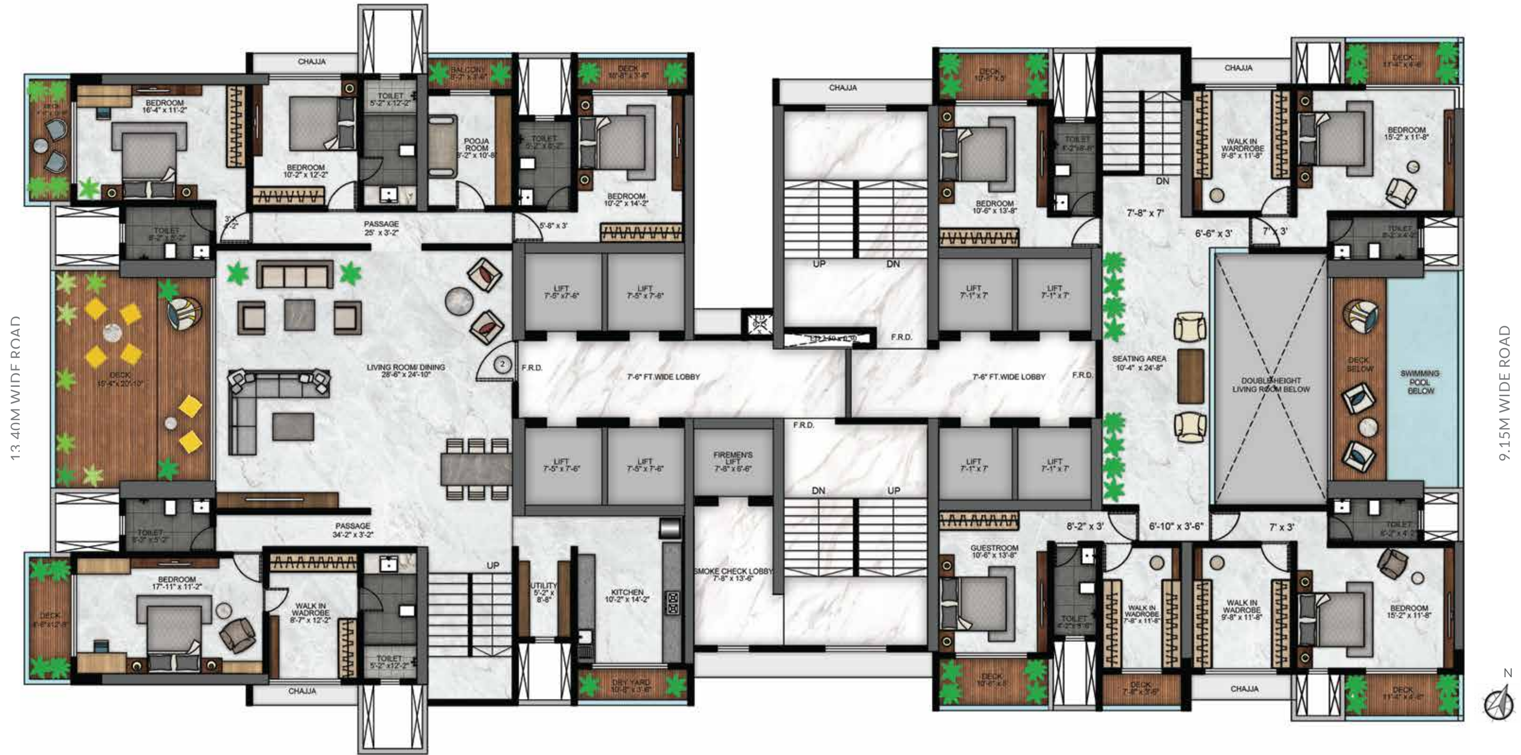
33RD FLOOR PLAN DUPLEX FLAT NO. 1 (UPPER LEVEL) DUPLEX FLAT NO. 2 (LOWER LEVEL)