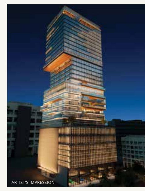
63 GOLD MEDAL AVENUE - Goregaon W MahaRera No. P51800027330