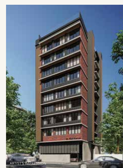
52 PARK AVENUE - Khar W MahaRera No. P51800032136